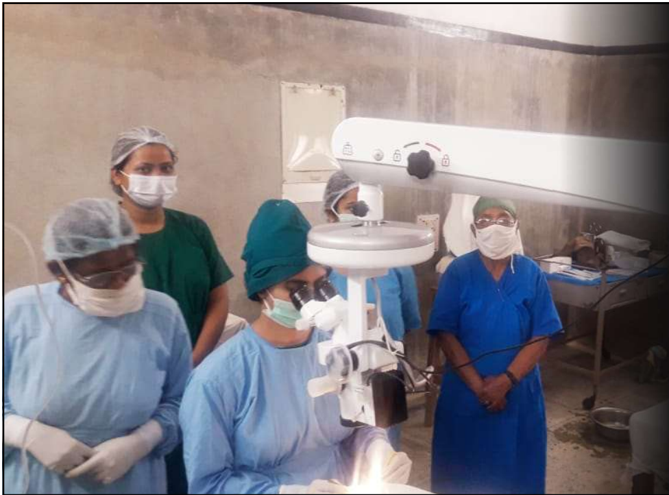
New operating microscope in second operating theatre...