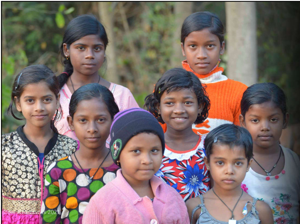
Marshal Duar residents (pre- pandemic)