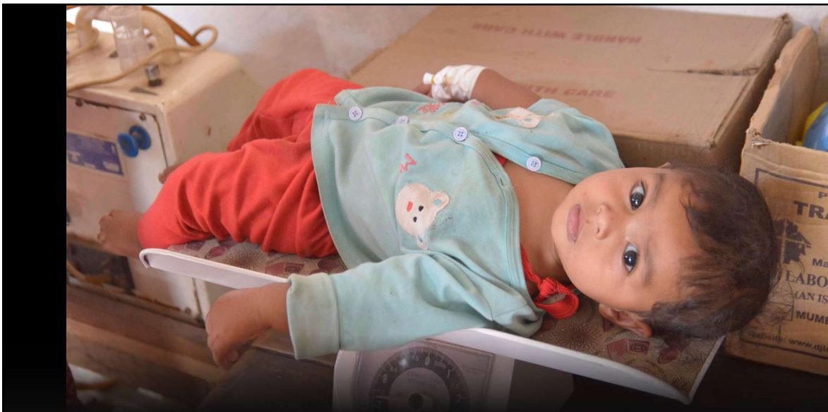
...and an older baby's development