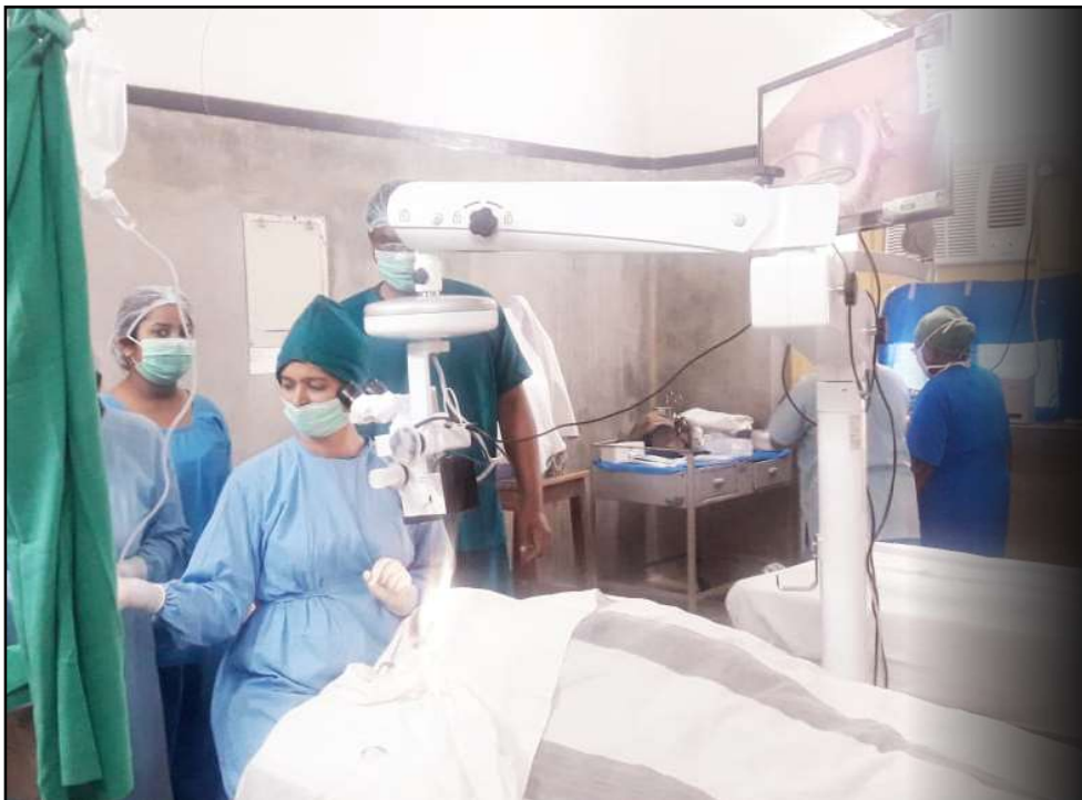
...which still needs refurbishment