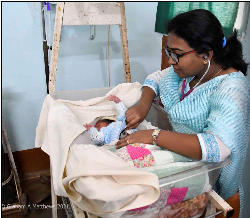
Checking out a new arrival...