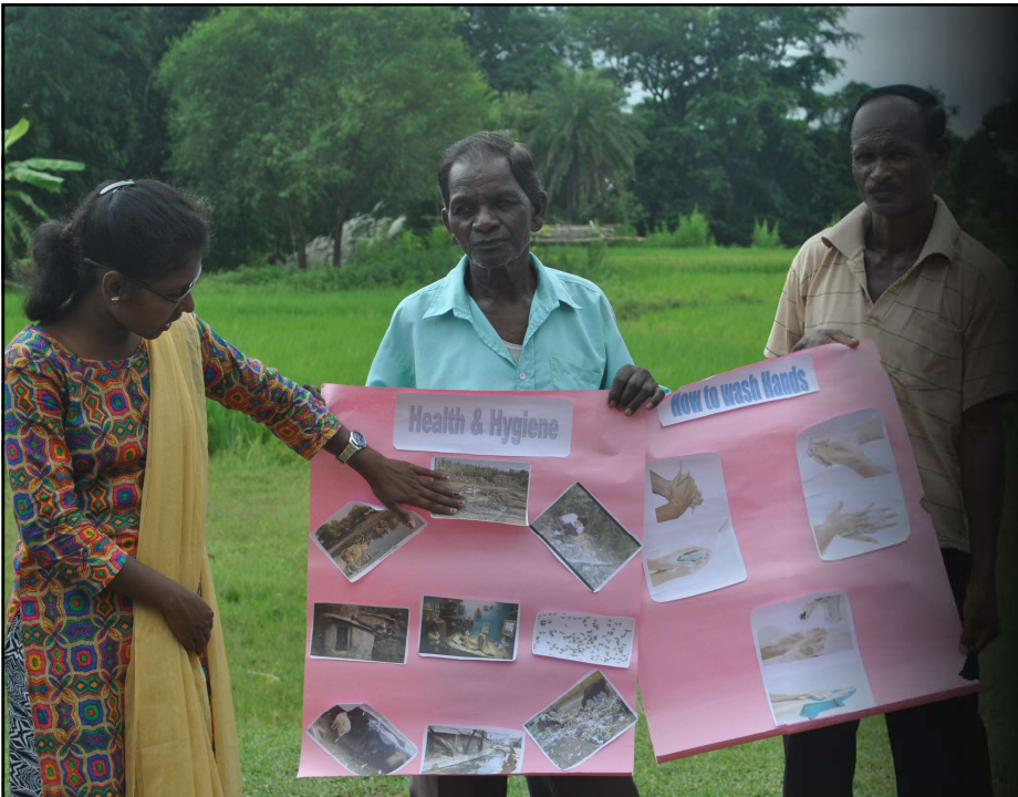
In the community teaching hand hygiene...