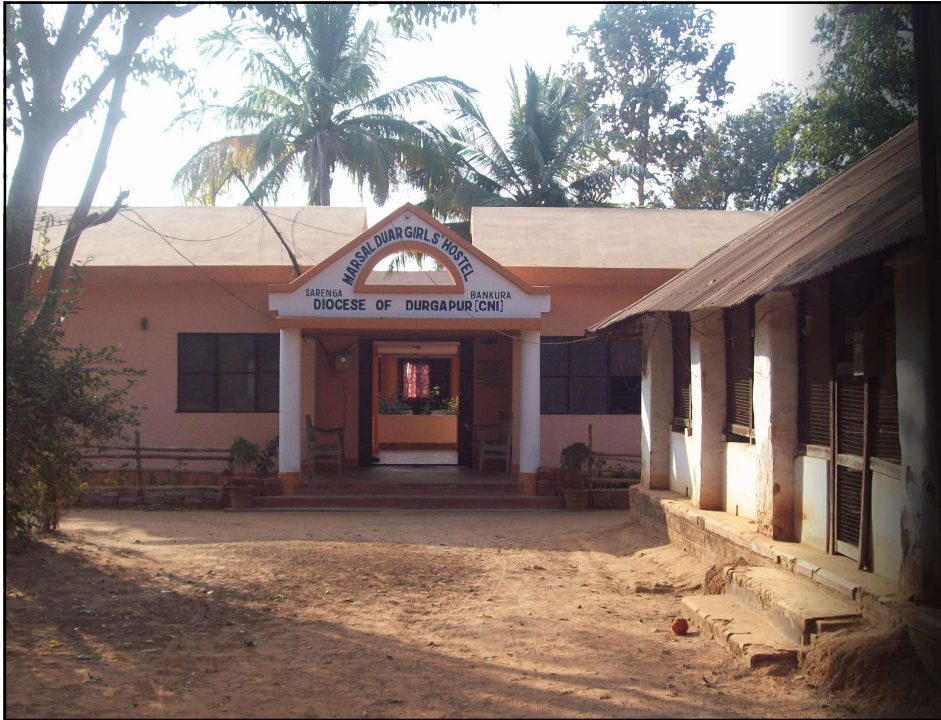
Marshal Duar girls' hostel