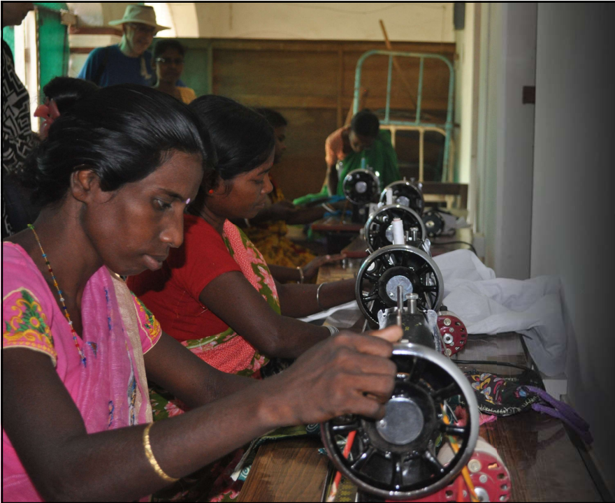
CAFORD sewing skills classes at KSN